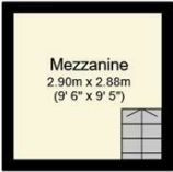
Mezzanine Floor area 8.5 m 2 (92 sq.ft.)