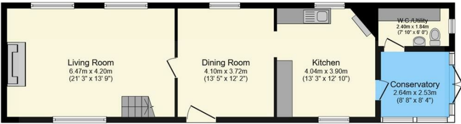
Ground Floor Floor area 71.5 m 2 (770 sq.ft.)