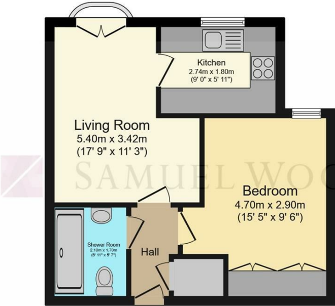
Floor Plan Floor area 38.0 m 2 (409 sq.ft.)