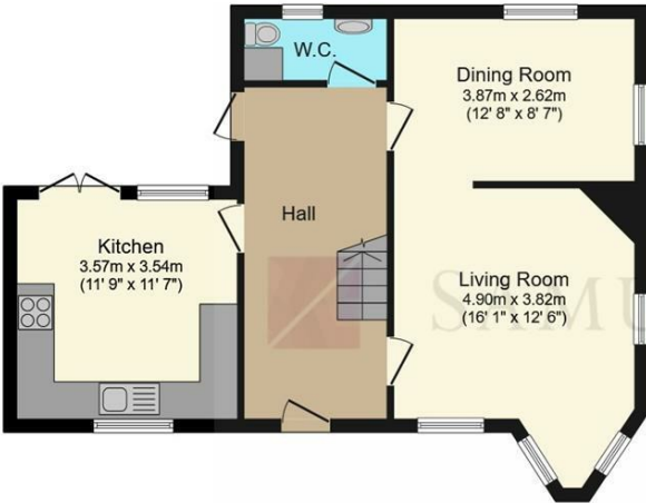
Ground Floor Floor area 54.3 m 2 (585 sq.ft.)