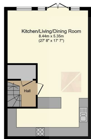
Lower Ground Floor Floor area 44.5 m 2 (479 sq.ft.)