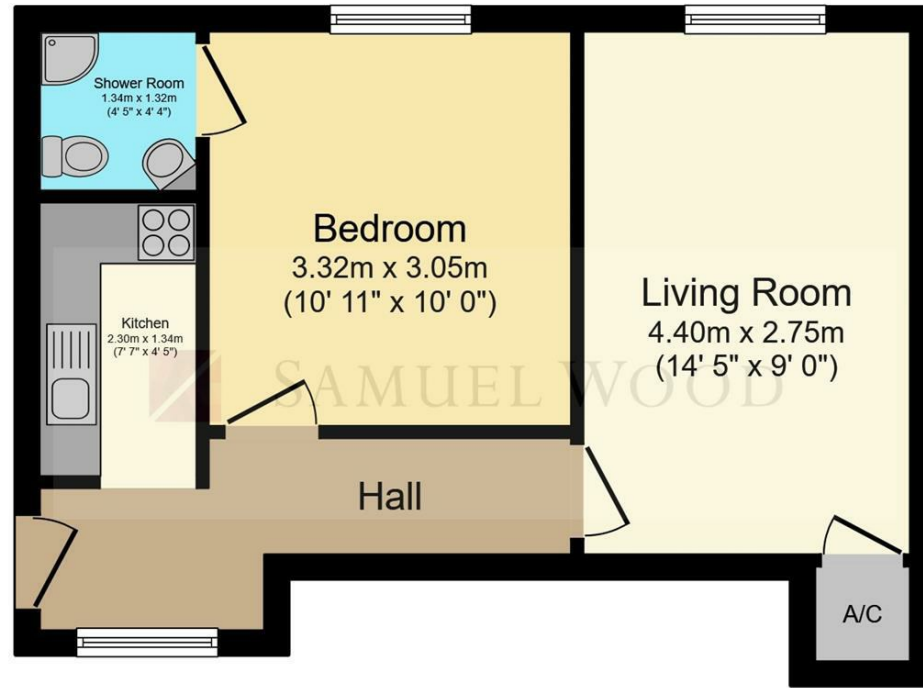
Floor Plan Floor area 34.1 m 2 (367 sq.ft.)