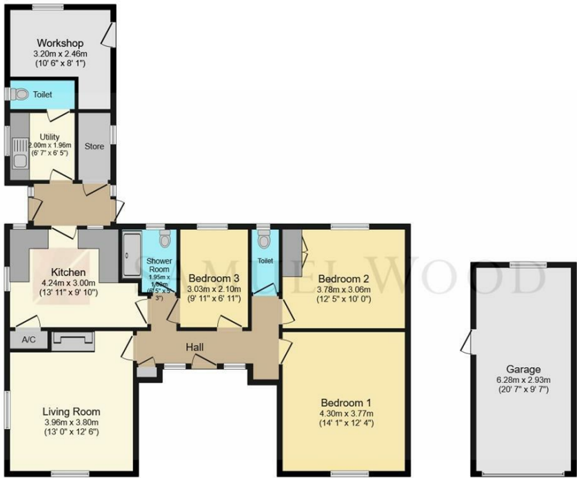
Floor Plan Floor area 96.2 m 2 (1,035 sq.ft.)