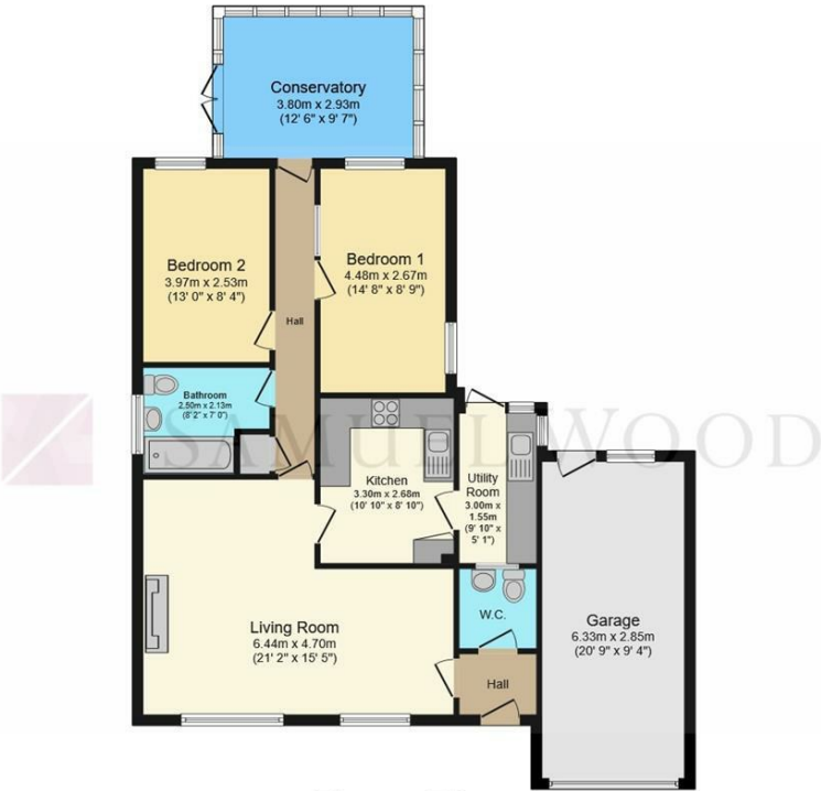
Floor Plan Floor area 106.8 sq.m. (1,150 sq.ft.)