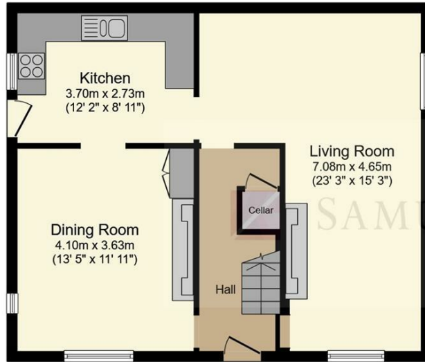
Ground Floor Floor area 59.6 m 2 (641 sq.ft.)