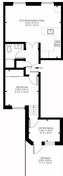
First Floor 467 ft 2

A stunning recently refurbished one bedroom first floor period conversion flat finished to a high specification finish with a balcony and the benefit of an additional spacious study/snug, located on a popular residential road within a short walk to West Brompton & Earls Court underground stations. The accommodation benefits from a Banham intercom system and comprises a fabulous open plan bay fronted living room with herringbone flooring, a stylish fully fitted kitchen with Siemens appliances, a generous double bedroom, a luxurious bathroom and the separate study/snug which is ideal for versatile use as either office/bedroom/TV room. Further benefits include excellent storage throughout. This is the perfect flat for both first time buyers and investors. Ongar Road is located moments from a variety of boutique shops and restaurants, as well as offering easy access to the A4/M4 and Central London and The West End. 999 year lease & No onward chain. PLEASE NOTE THESE PHOTOS ARE INDICATIVE OF THE WHOLE BUILDING AND DO NOT NECESSARILY REPRESENT THIS INDIVIDUAL PROPERTY.