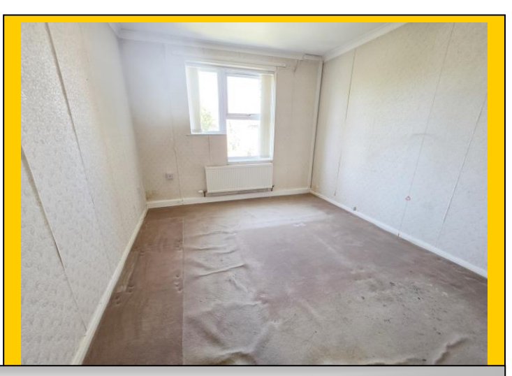
Leonard Hackett Court, St Winifreds Rd, Bournemouth, Dorset, BH2 6PR