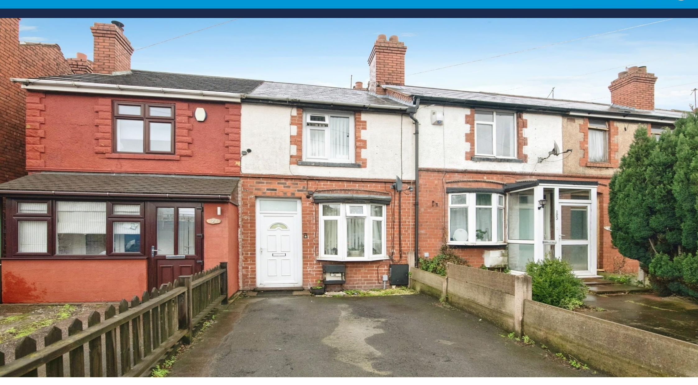
Greets Green Road West Bromwich B70 9ET