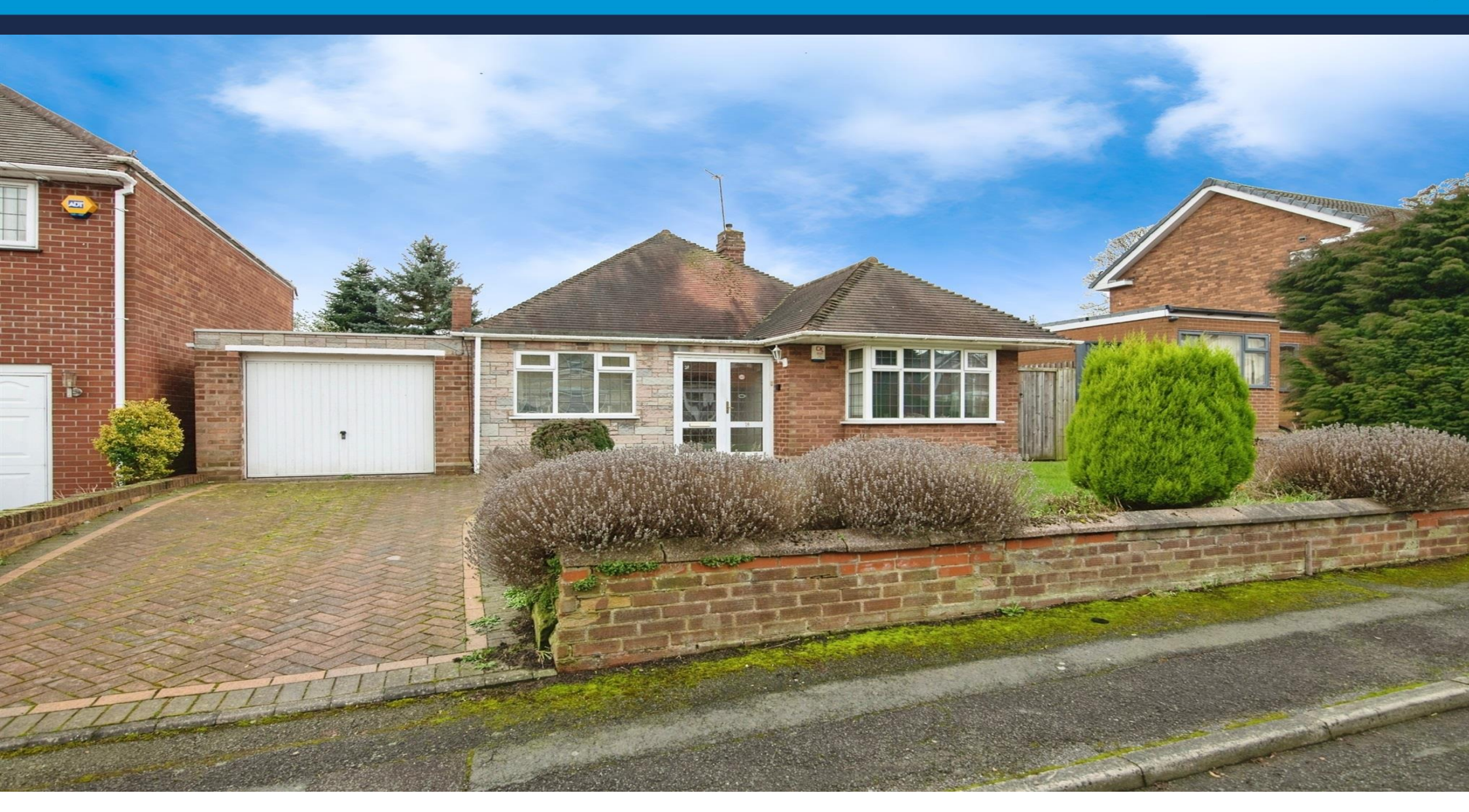
Newton Street West Bromwich B71 3RG