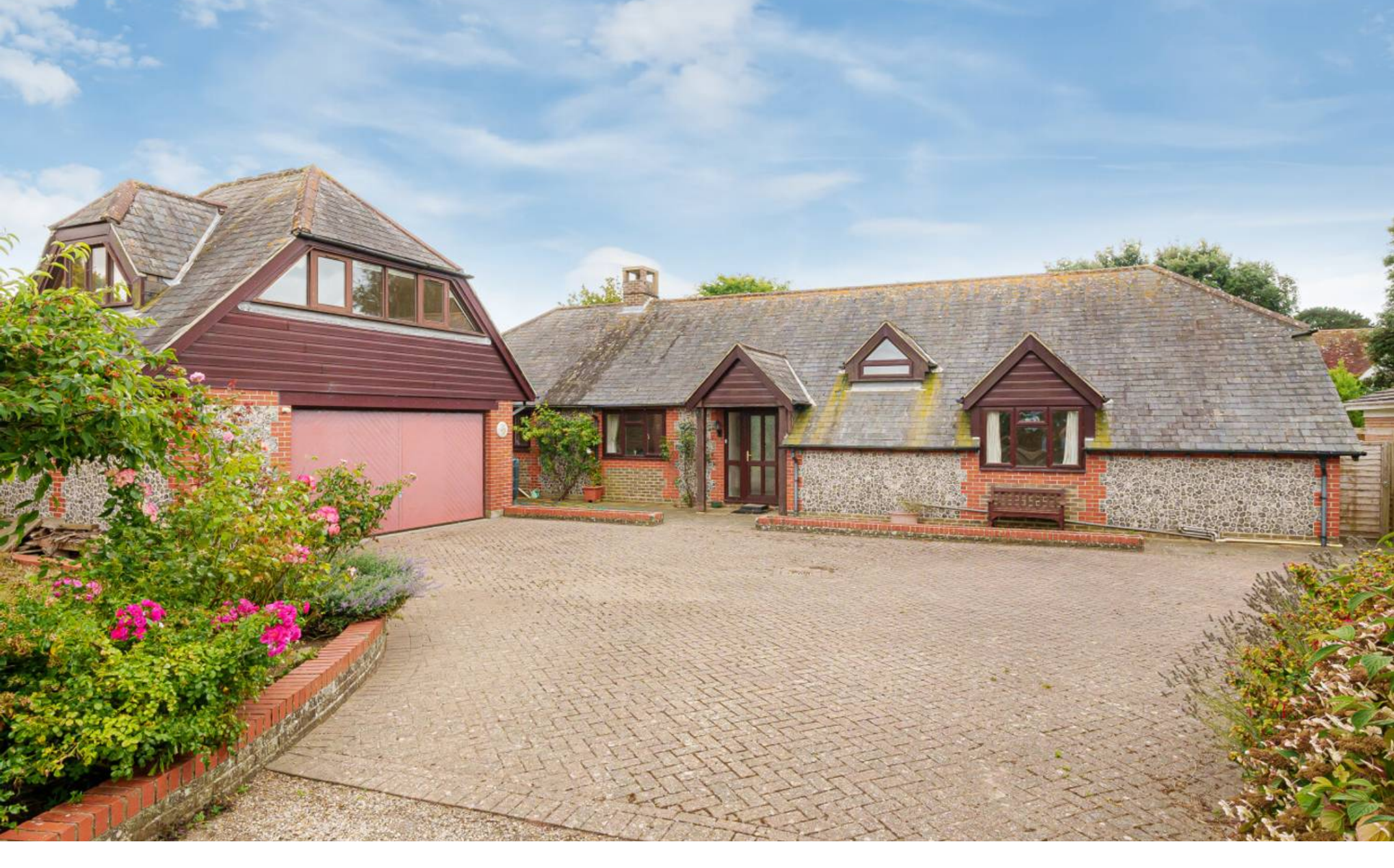
Chester House Earnley Manor Close, Earnley Guide Price £850,000