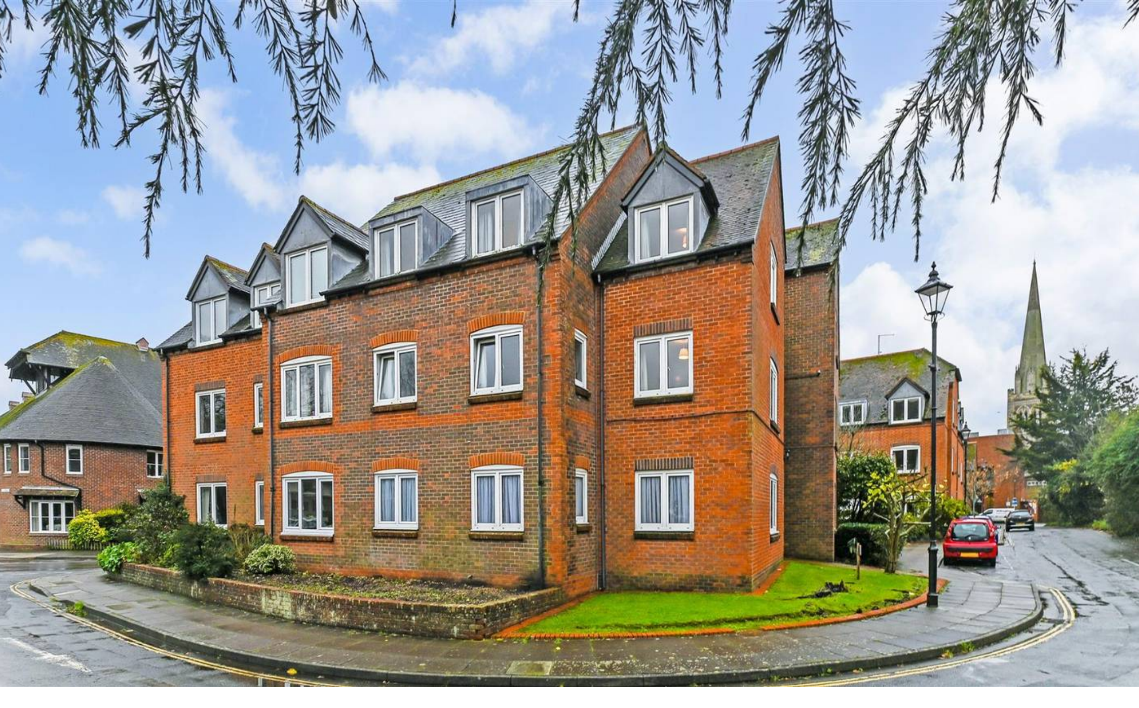
33 Providence Place Chapel Street, Chichester Guide Price £180,000