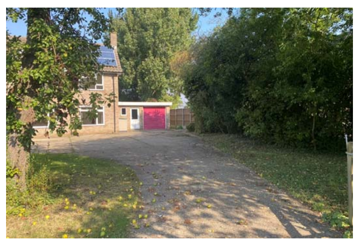
NOTE: Items depicted in the photographs or described within these particulars are not necessarily included within the tenancy agreement. These particulars are produced in good faith, are set out as a general guide only and do not constitute any part of a contract. No responsibility can be accepted for any expenses incurred by intending purchasers or lessees in inspecting properties which have been sold, let or withdrawn. September 2024