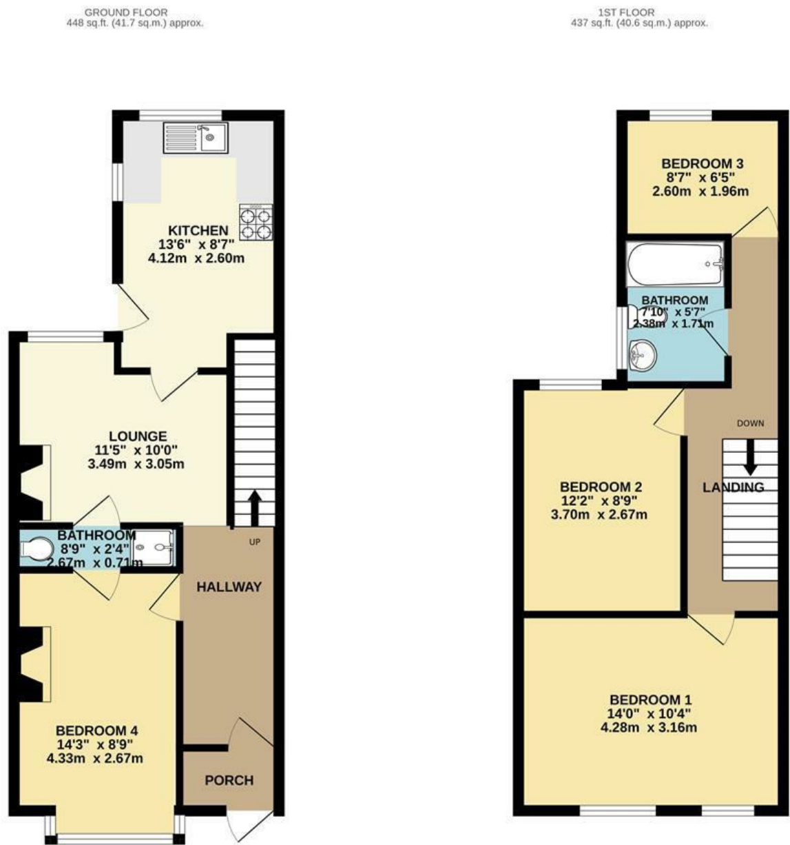
FOUR BEDROOM TERRACED HOUSE TOTAL FLOOR AREA : 885 sq.ft. (82.3 sq.m.) approx. Whilst every attempt has been made to ensure the accuracy of the floorplan contained here, measurements of doors, windows, rooms and any other items are approximate and no responsibility is taken for any error, omission or mis-statement. This plan is for illustrative purposes only and should be used as such by any prospective purchaser. The services, systems and appliances shown have not been tested and no guarantee as to their operability or efficiency can be given. Made with Metropix ©2024

These particulars, whilst believed to be accurate are set out as a general outline only for guidance and do not constitute any part of an offer or contract. Intending purchasers should not rely on them as statements of representation of fact, but must satisfy themselves by inspection or otherwise as to their accuracy. No person in this firms employment has the authority to make or give any representation or warranty in respect of the property.