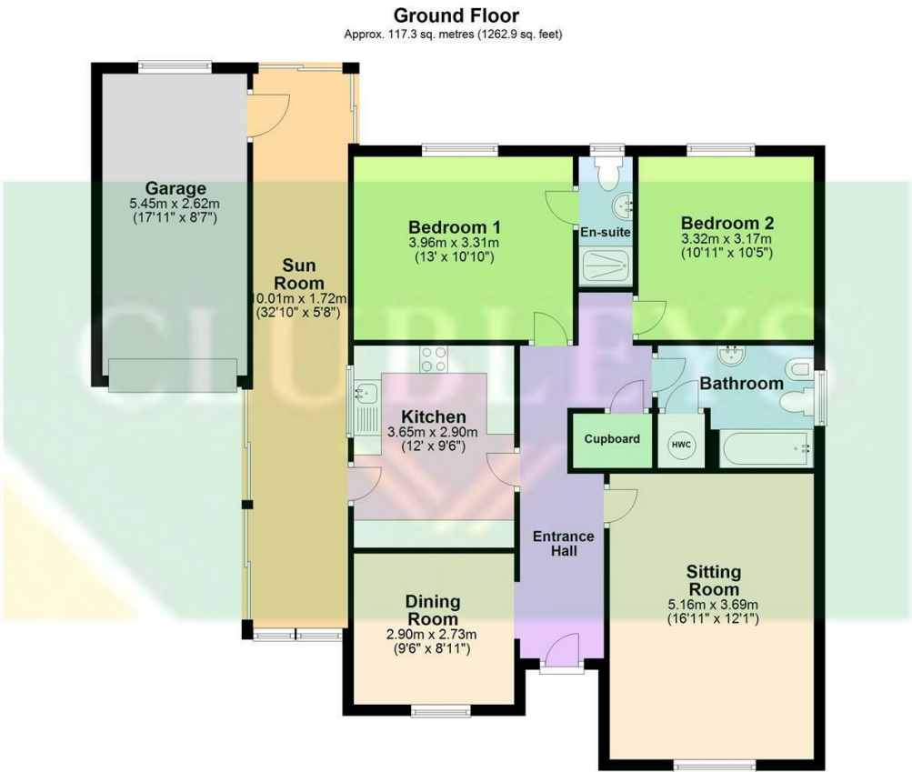
Total area: approx. 117.3 sq. metres (1262.9 sq. feet)

8, Old Lea, Holme-On-Spalding-Moor, YO43 4BL £275,000