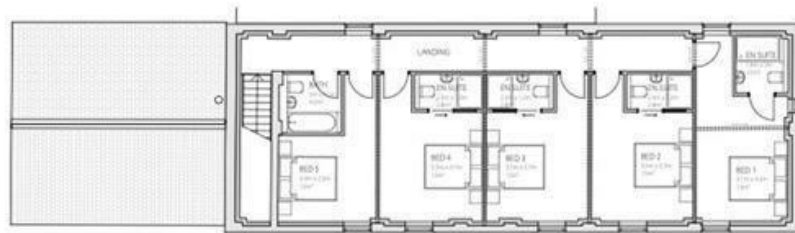
FIRST FLOOR PLAN (1:100)