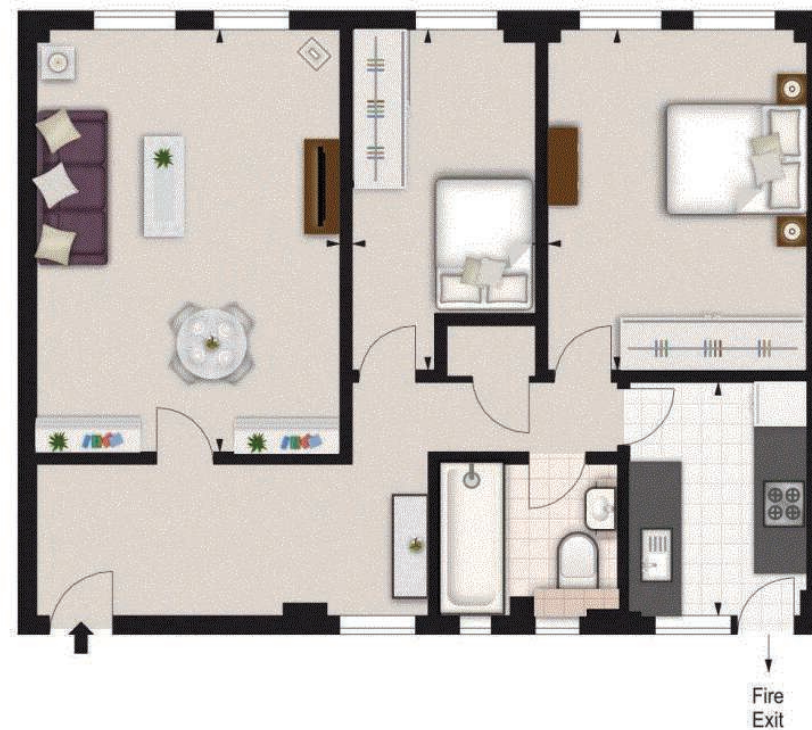
ILLUSTRATION FOR IDENTIFICATION PURPOSES ONLY. NOT TO SCALE * As Defined by RICS - Code of Measuring Practice

APPROX. GROSS INTERNAL AREA * 709 Ft 2 - 65.87 M 2