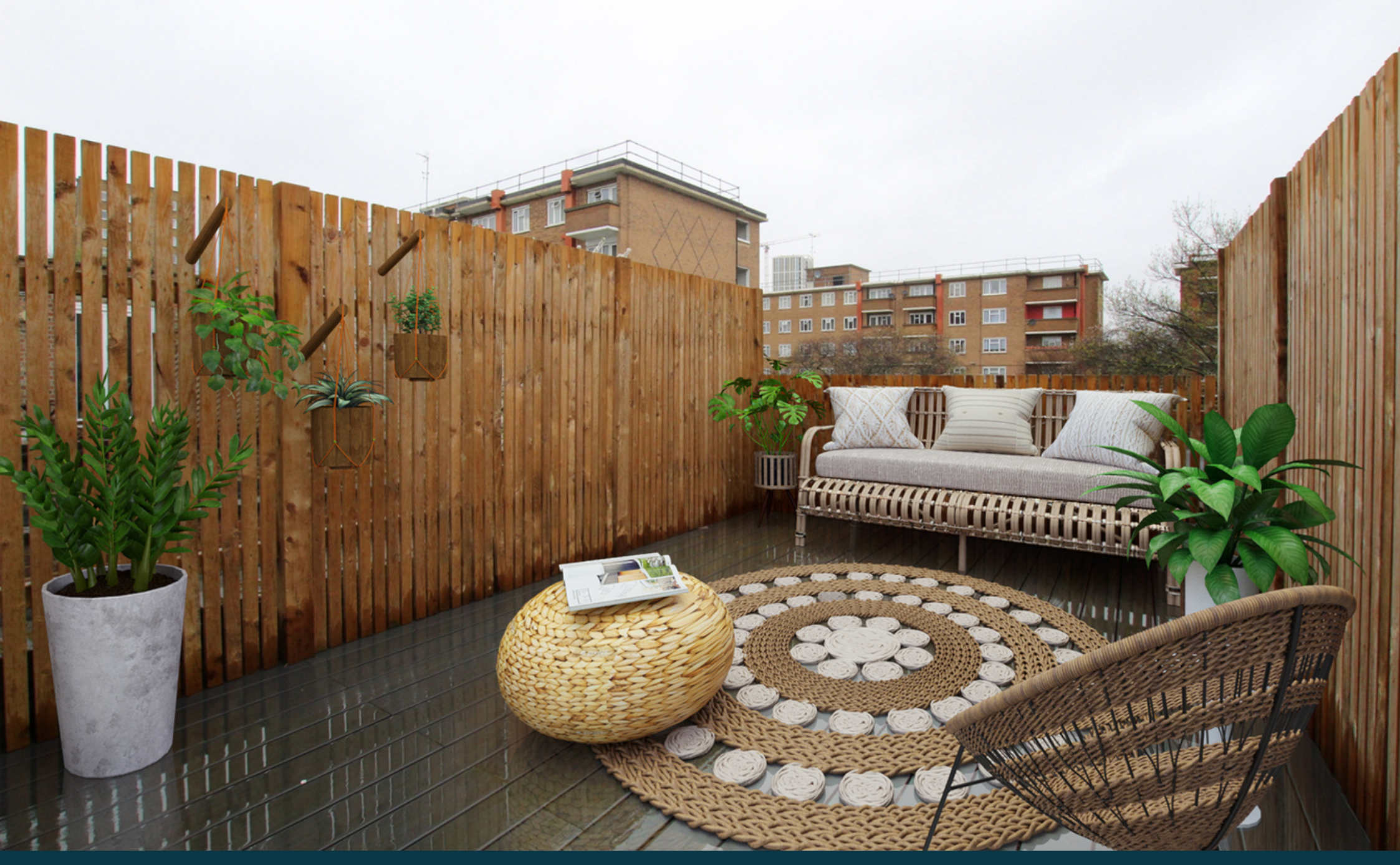
Commercial Road, London, E1 2PS