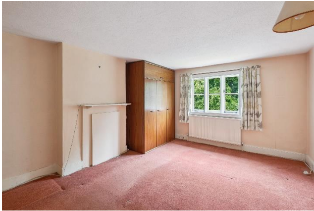
BEDROOM TWO sealed fireplace, radiator, secondary glazed window.