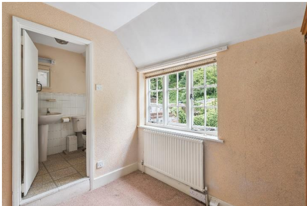
BEDROOM THREE/STUDY radiator, view over rear garden and door to

SHOWER ROOM suite of shower cubicle with Mira shower unit, pedestal basin, low level w.c., heated towel rail with inset radiator.