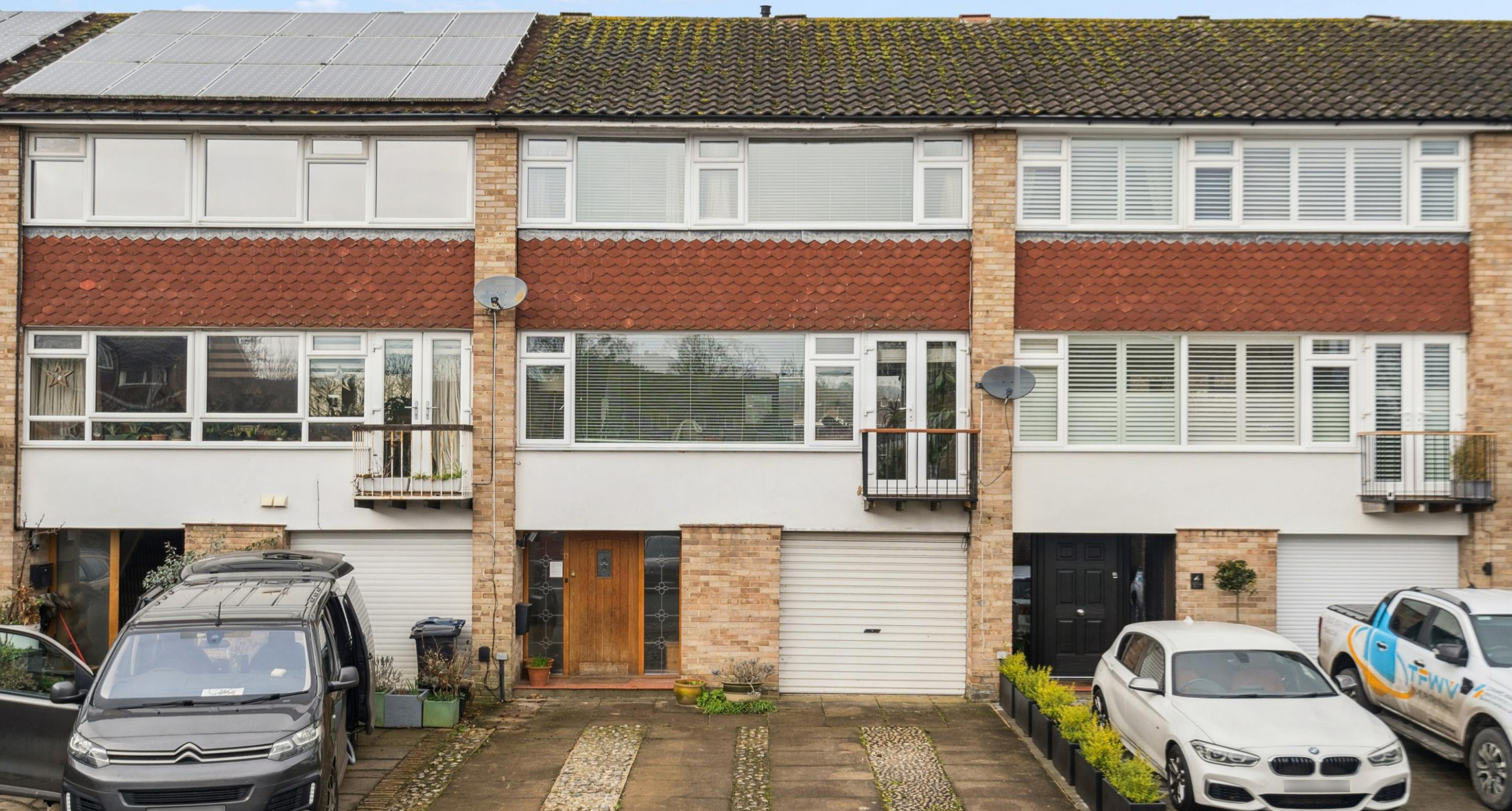
6 ROOKERY COURT, MARLOW PRICE: £625,000 FREEHOLD