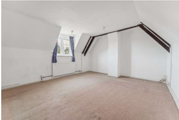
BEDROOM TWO radiator, beams.