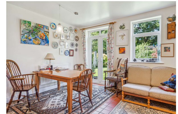
REAR LOBBY quarry tiled flooring, storage cupboard, radiator.

CLOAKROOM comprising low level w.c., butlers sink, space and plumbing for washing machine, double glazed windows, quarry tiled flooring.