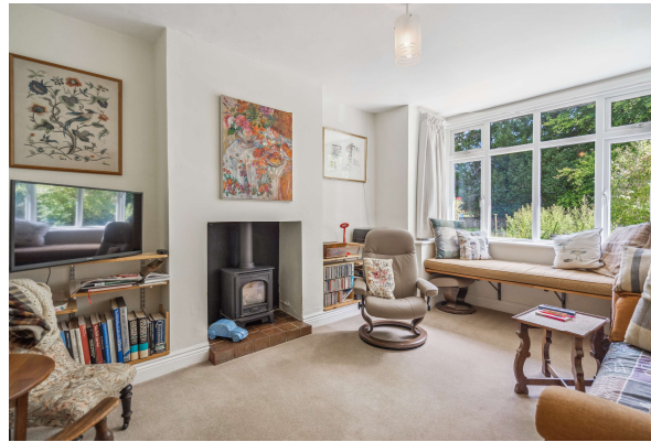
LIVING ROOM front aspect room with double glazed bay window, feature fireplace with inset gas log burner, window seat, radiator.

Front door to ENTRANCE HALL with stairs to First Floor Landing, radiator.