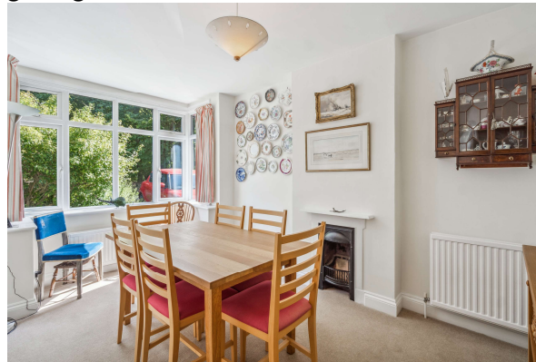
DINING ROOM front aspect room with double glazed bay window, cast iron feature fireplace, radiators.

KITCHEN/BREAKFAST ROOM fitted with a matching range of wooden floor and wall units, granite work surfaces, central island unit, single drainer single bowl sink unit with water softener under, five burn gas hob, electric oven, space and plumbing dishwasher, dual aspect double glazed windows, larder cupboard, quarry tiled flooring,