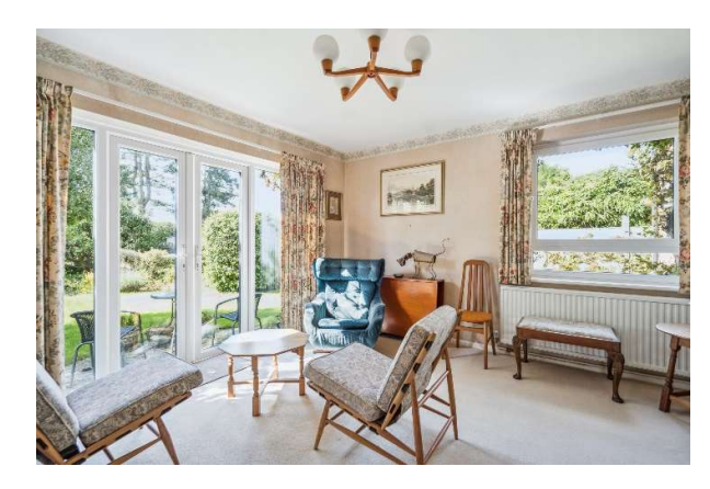
SITTING ROOM double glazed double doors overlooking the rear garden, radiator.

LIVING ROOM open stone fireplace, polished parquet floor, two radiators, double glazed windows with views over the front towards the Green, glazed double doors to