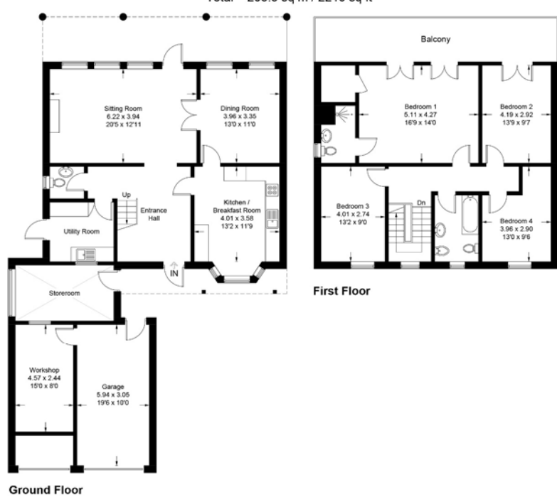
For identification purposes only. Not to scale. Copyright fullaspect.co.uk Produced for Clarke and Simpson

Approximate Gross Internal Area = 161.0 sq m / 1733 sq ft Garage / Storage / Outbuilding = 44.3 sq m / 477 sq ft Total = 205.3 sq m / 2210 sq ft