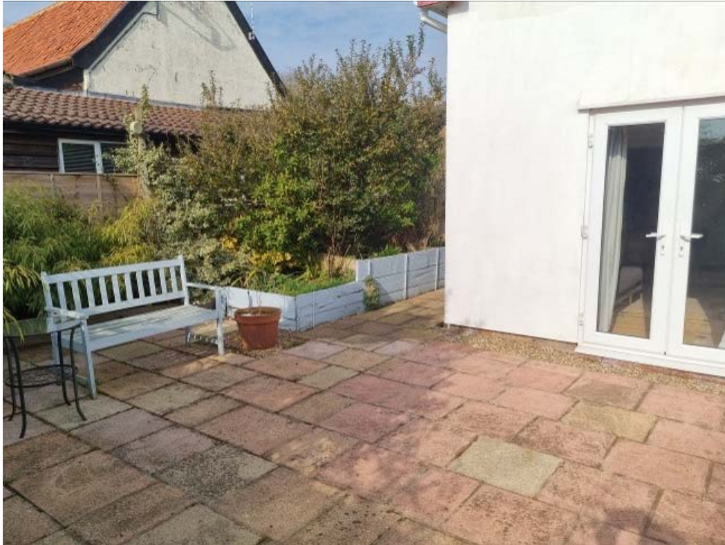
White Cottage, Sweffling Approx. Gross Internal Floor Area - 656 Sq ft / 61 Sq M