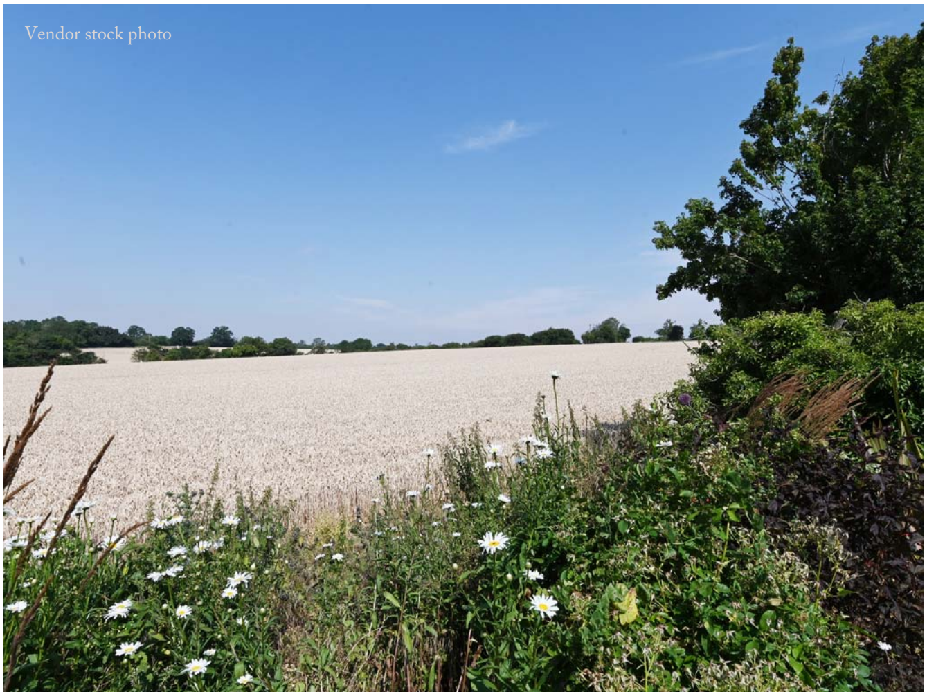
Vendor stock photo

For those using the What3Words app: ///countries.pleasing.shuttled