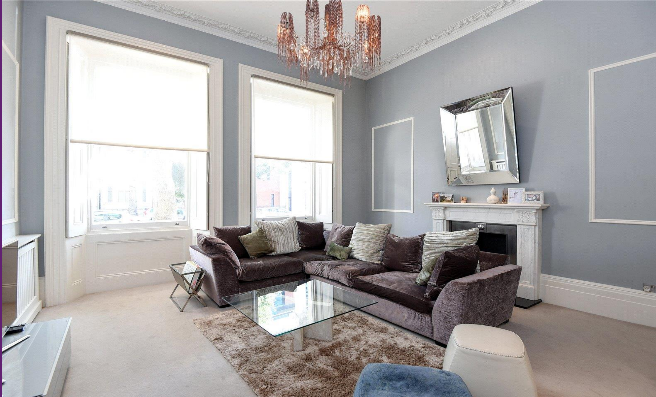
Queens Gate South Kensington, SW7