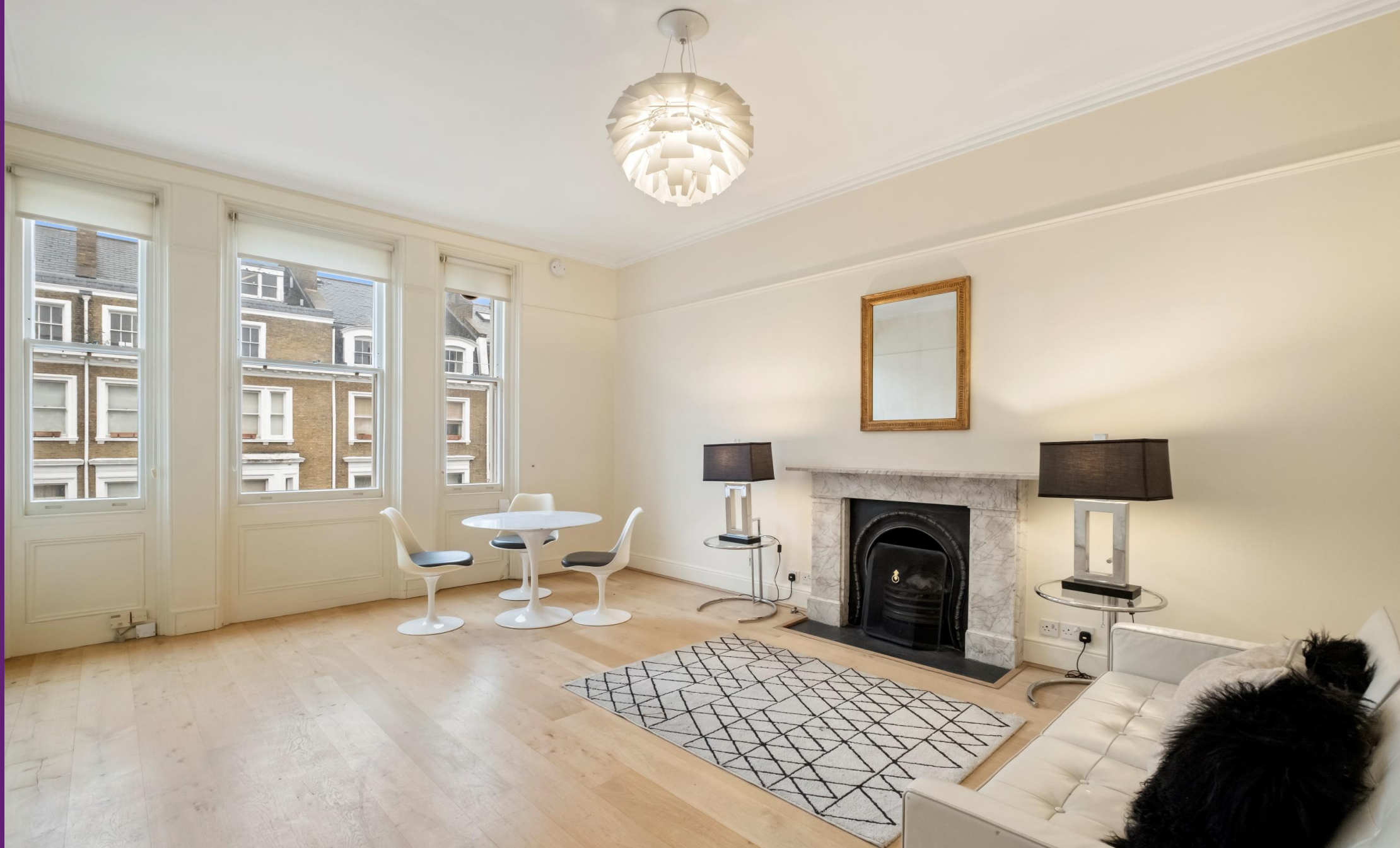
Bina Gardens South Kensington, SW5