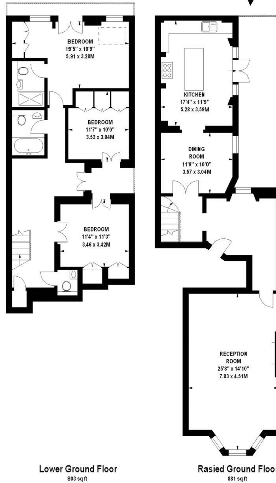
Illustration For Identification Purposes Only. Not To Scale *Floorplan Drawn According To RICS Guidelines

Chesterton UK Services Limited trading as Chestertons for themselves and for the vendor of this property whose agents they are, give notice that (i) these particulars do not constitute any part of an offer or contract, (ii) all statements contained within these particulars are made without responsibility on the part of Chestertons or the vendor, (iii) whilst made in good faith, none of the statements contained within these particulars are to be relied upon as a statement or representation of fact, (iv) any intending purchasers must satisfy themselves by inspection or otherwise as to the correctness of each of the statements contained within these particulars, (v) the vendor does not make or give either Chestertons or any person in their employment any authority to make or give representation or warranty whatsoever in relation to this property. Wide angle lenses may be used. ©Copyright Chestertons | Chesterton Global Ltd | Registered Office 40 Connaught Street, Hyde Park, London W2 2AB Registered Company Number 05334580.