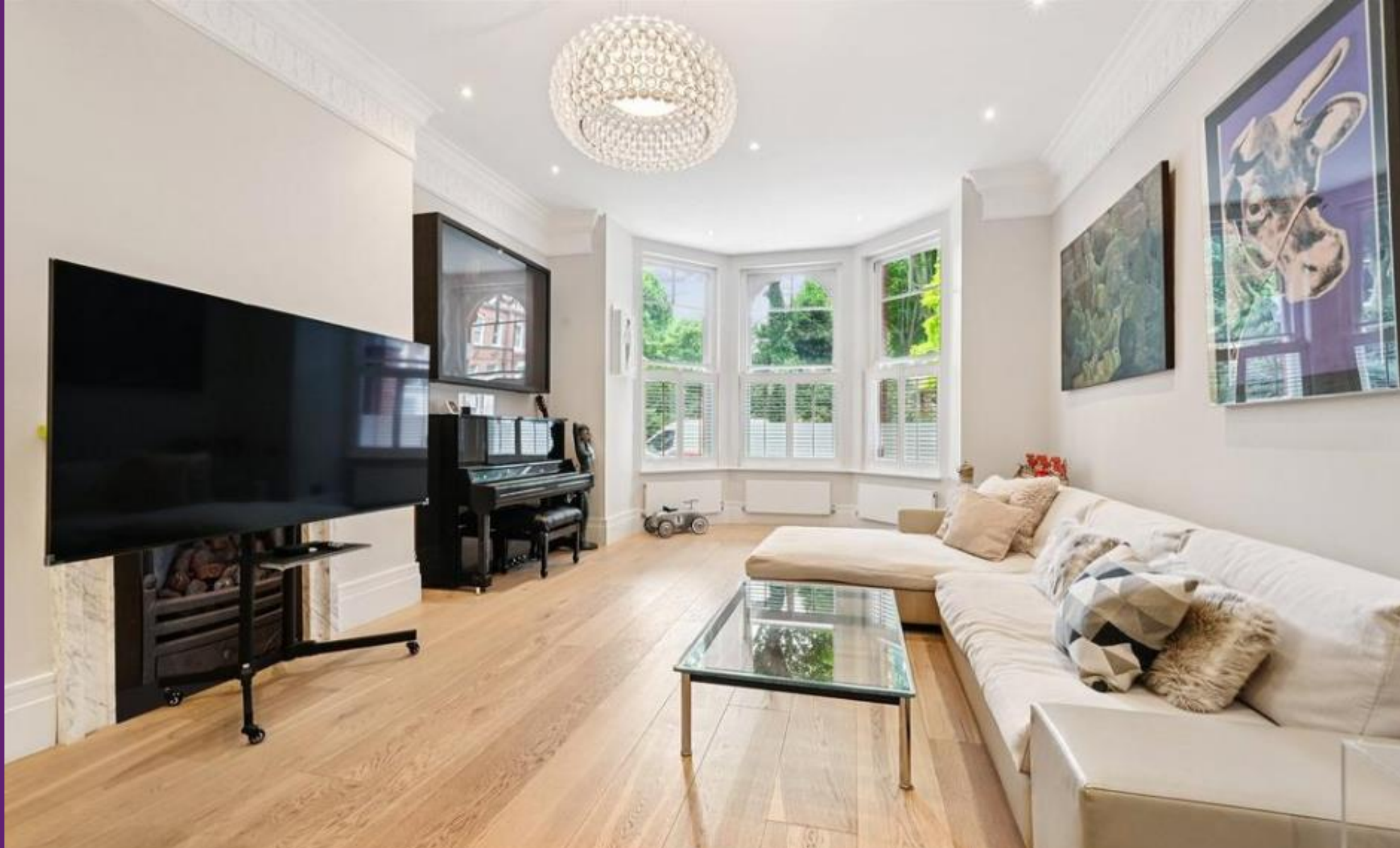
Barkston Gardens Earls Court, SW5