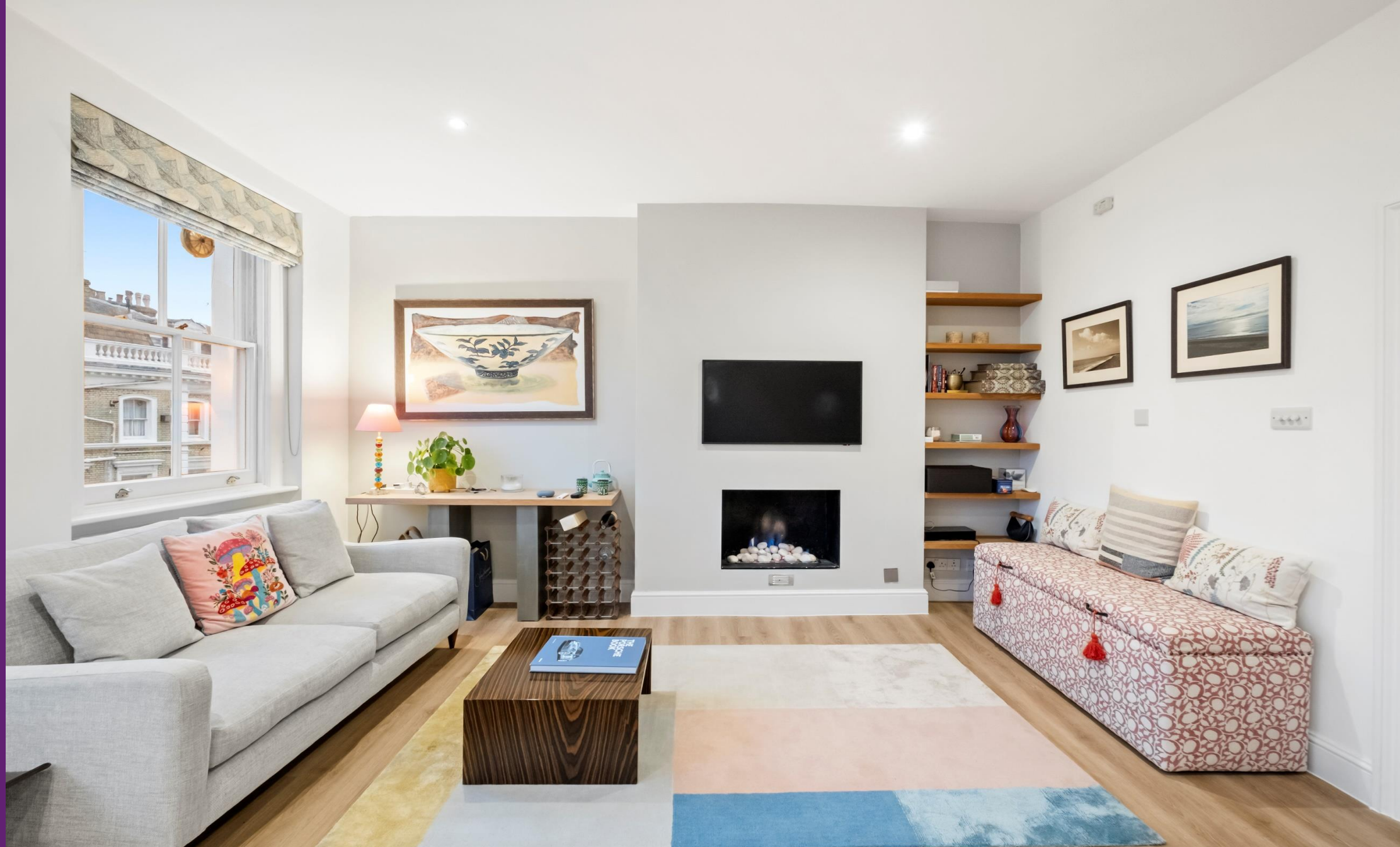
Onslow Gardens South Kensington, SW7