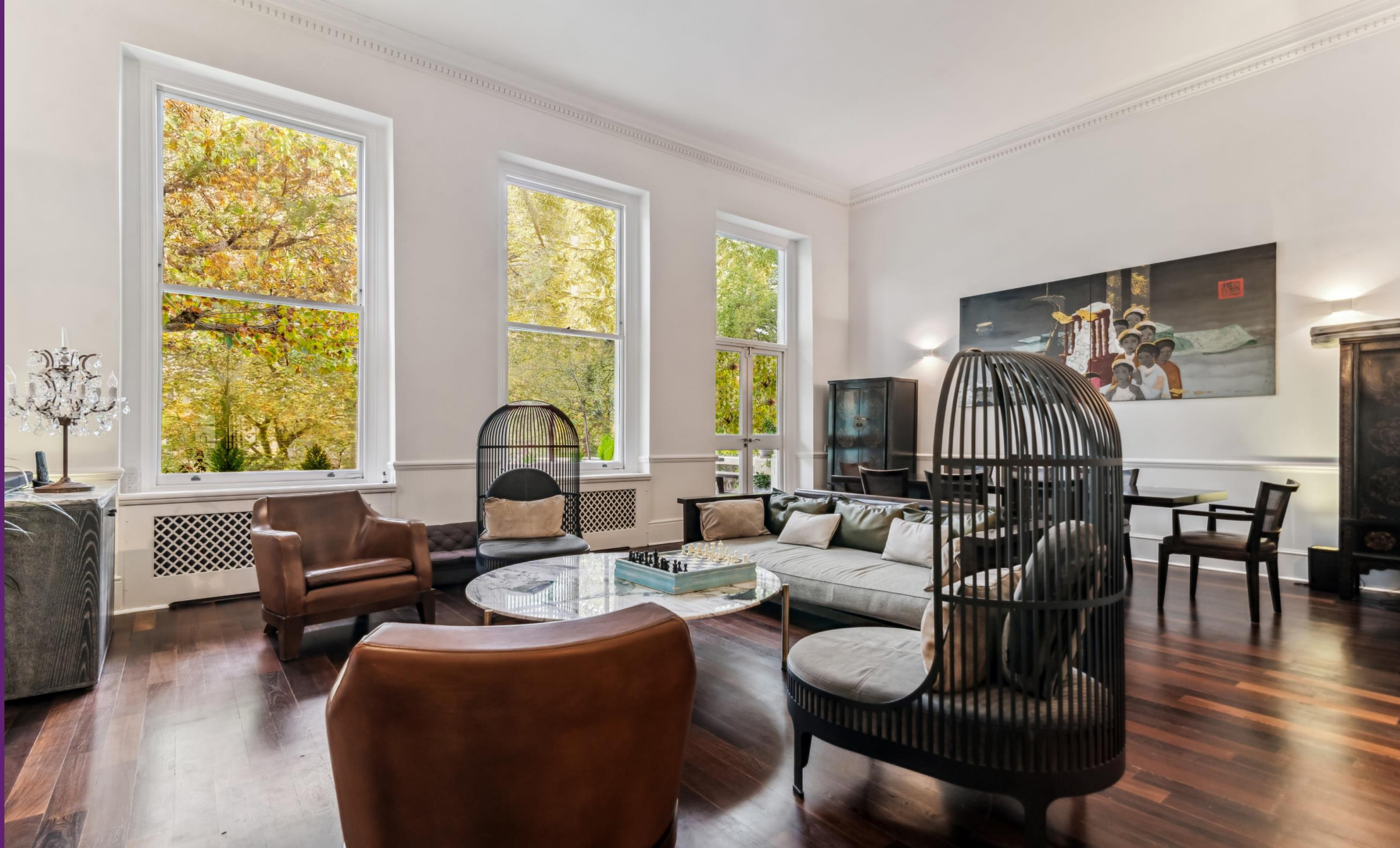
Queens Gate South Kensington, SW7