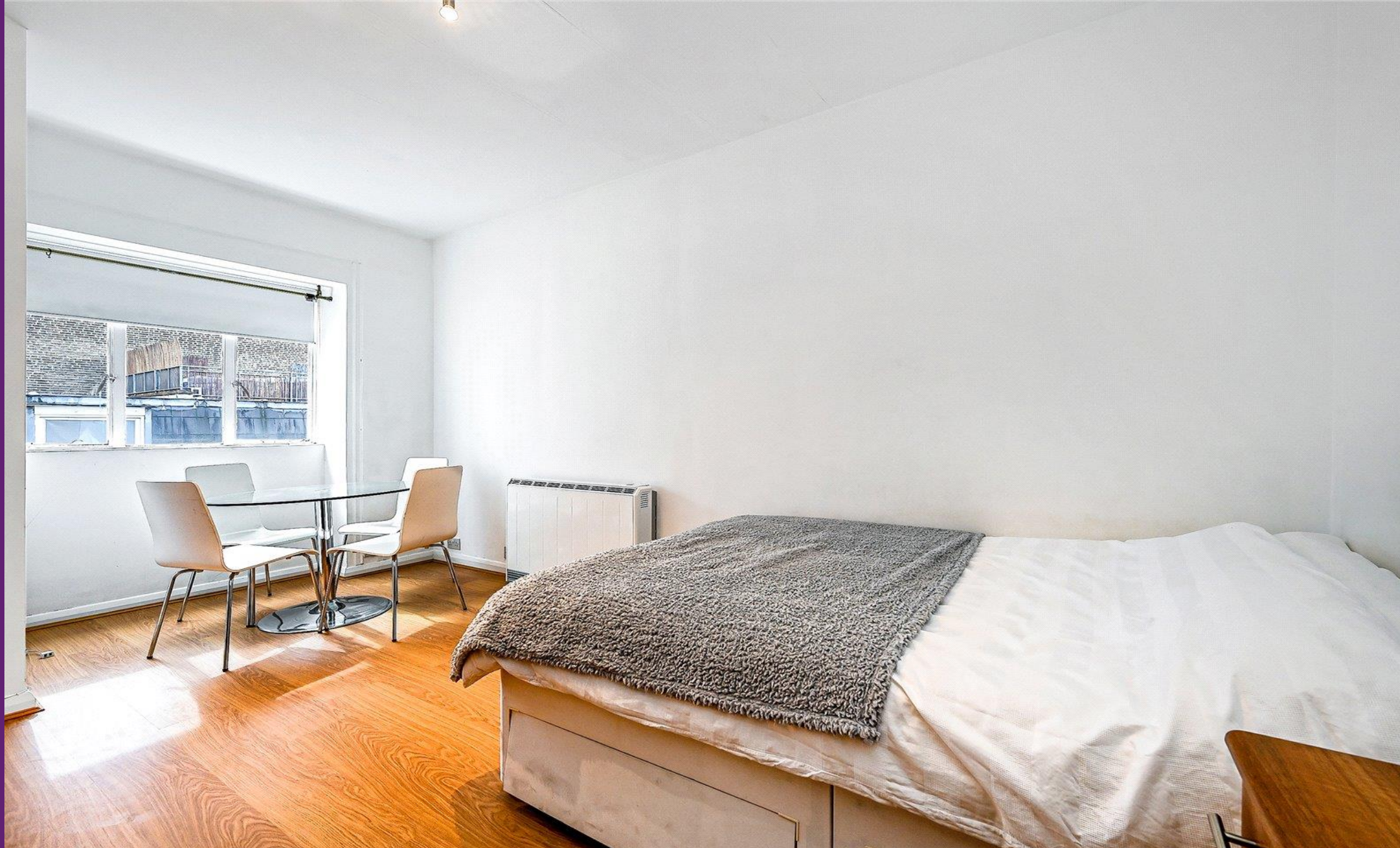
Kendrick Place South Kensington, SW7