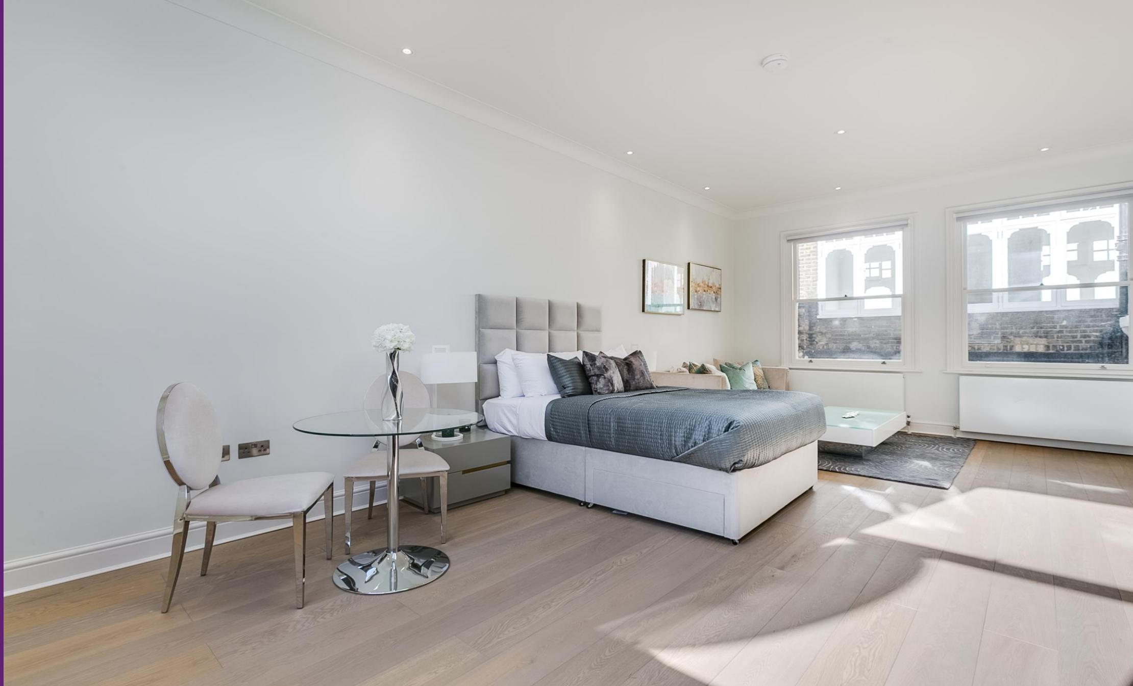
Queens Gate Terrace South Kensington, SW7