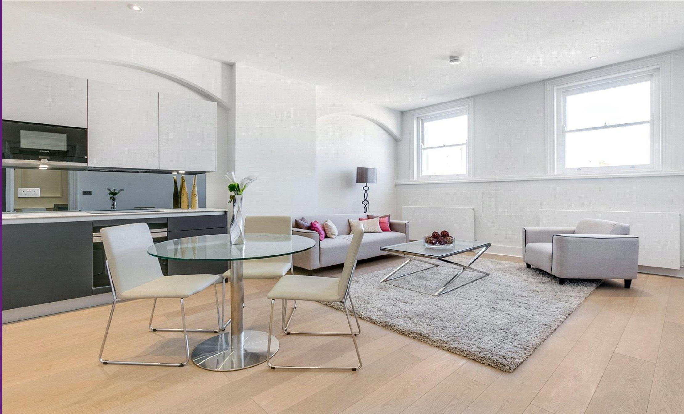
Queens Gate Terrace South Kensington, SW7