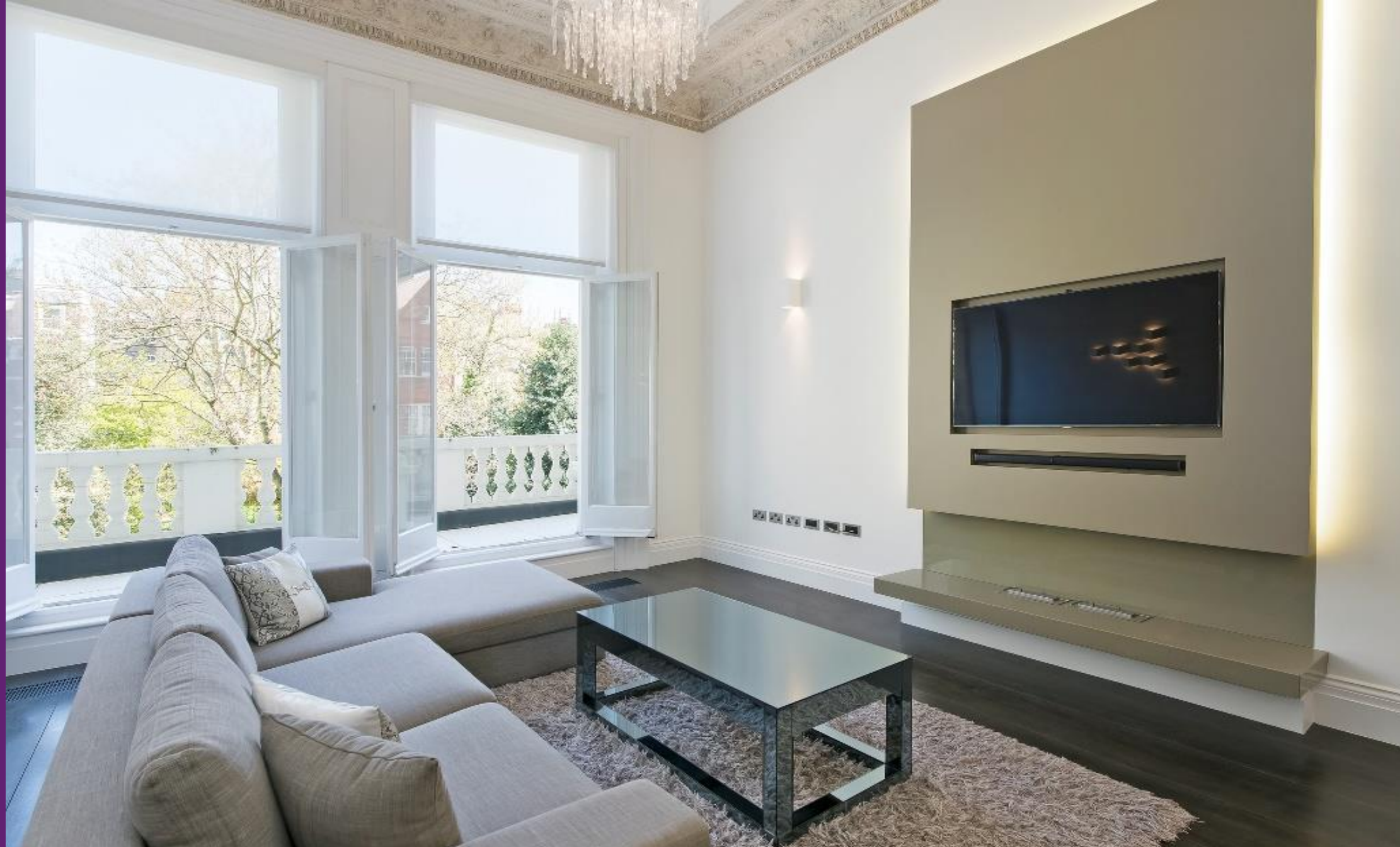
Earls Court Square Earls Court, SW5