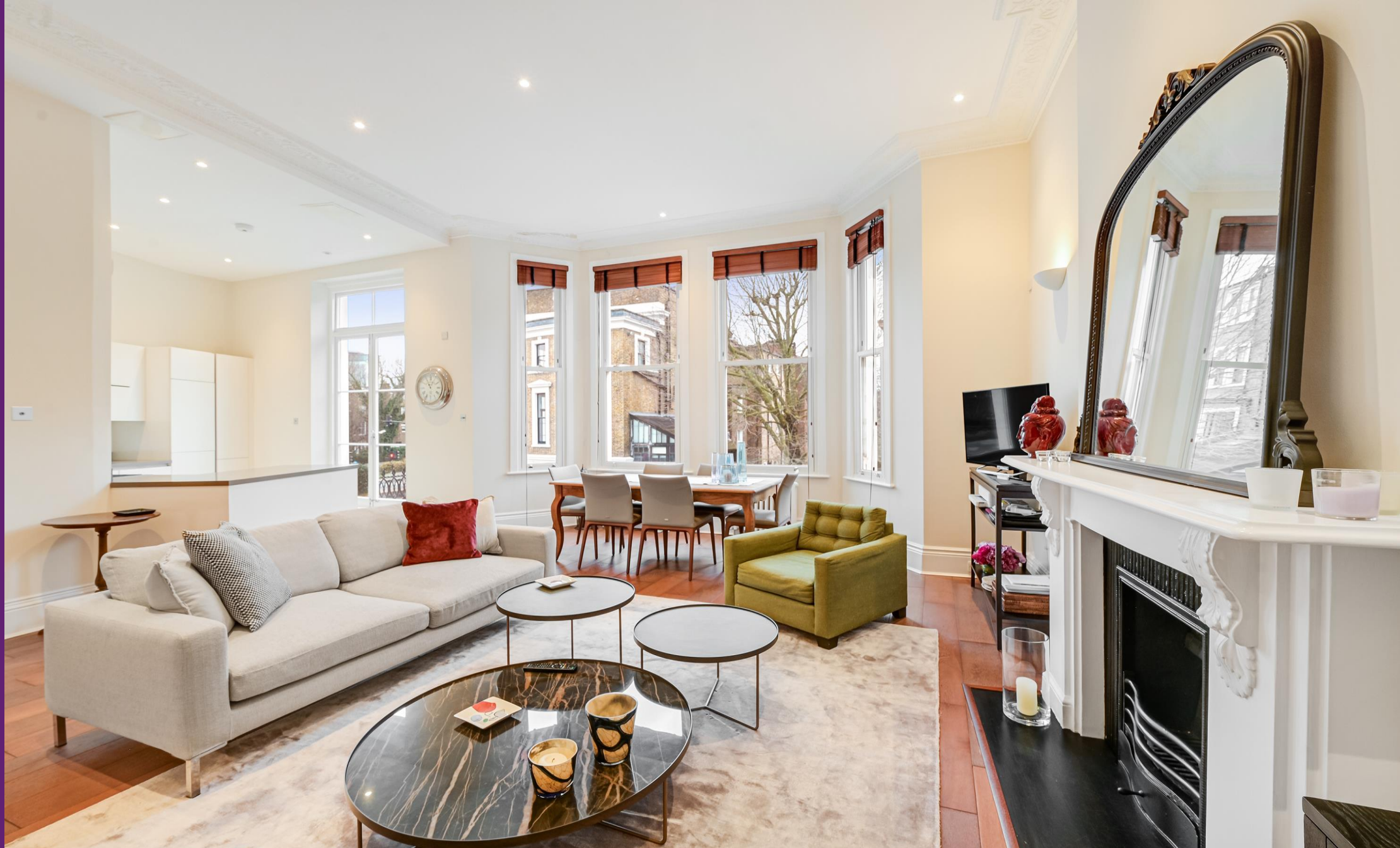
Cromwell Crescent Earls Court, SW5