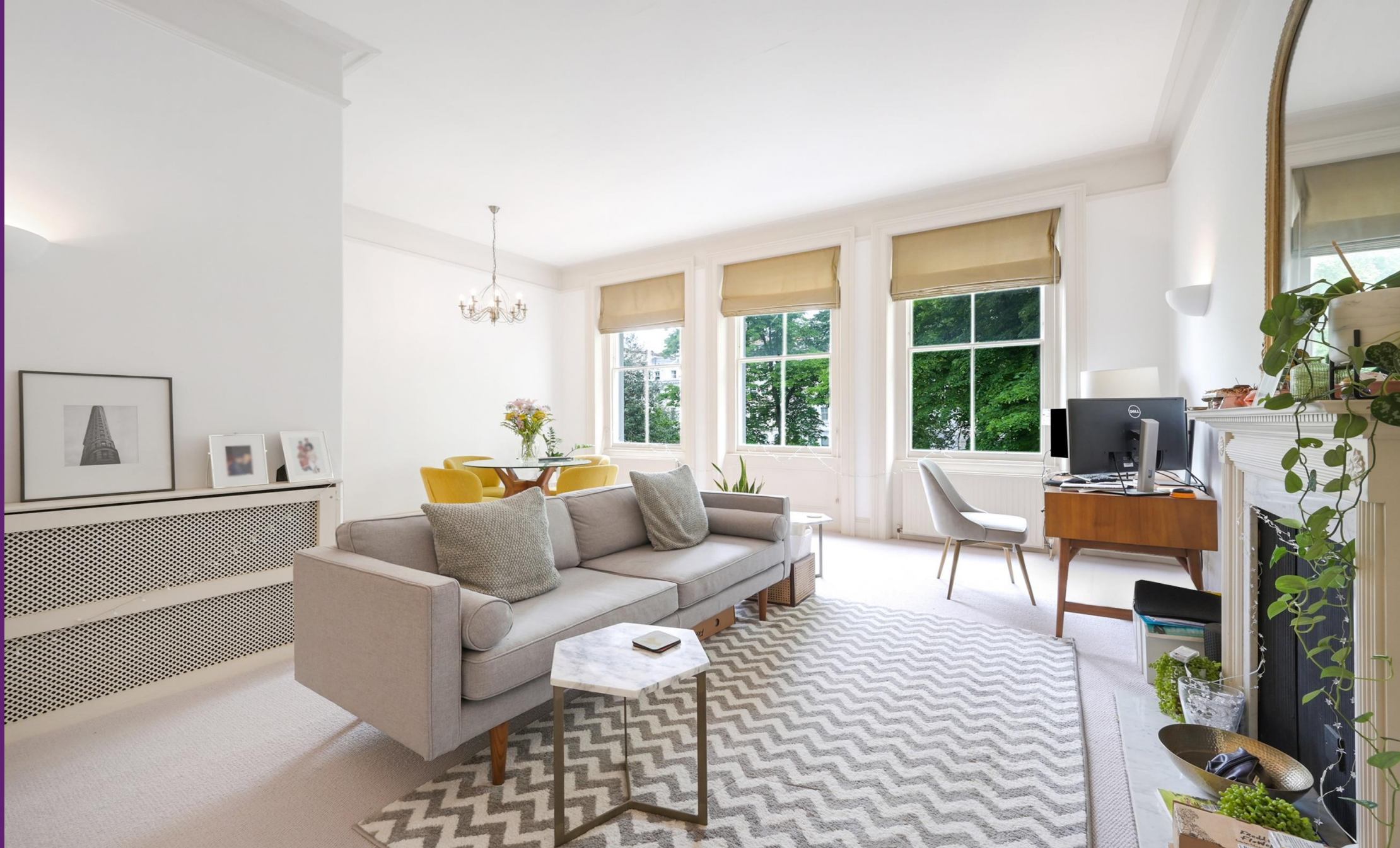
Cornwall Gardens South Kensington, SW7