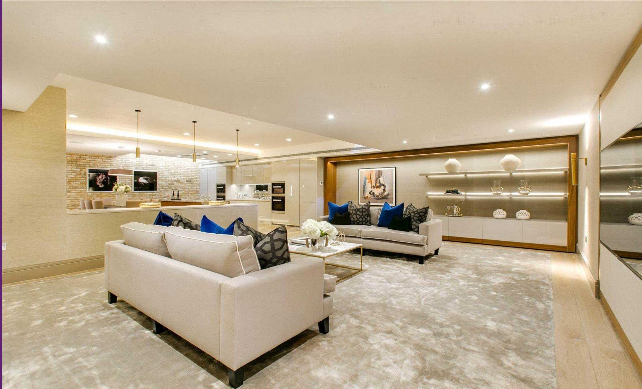
Elvaston Mews South Kensington, SW7