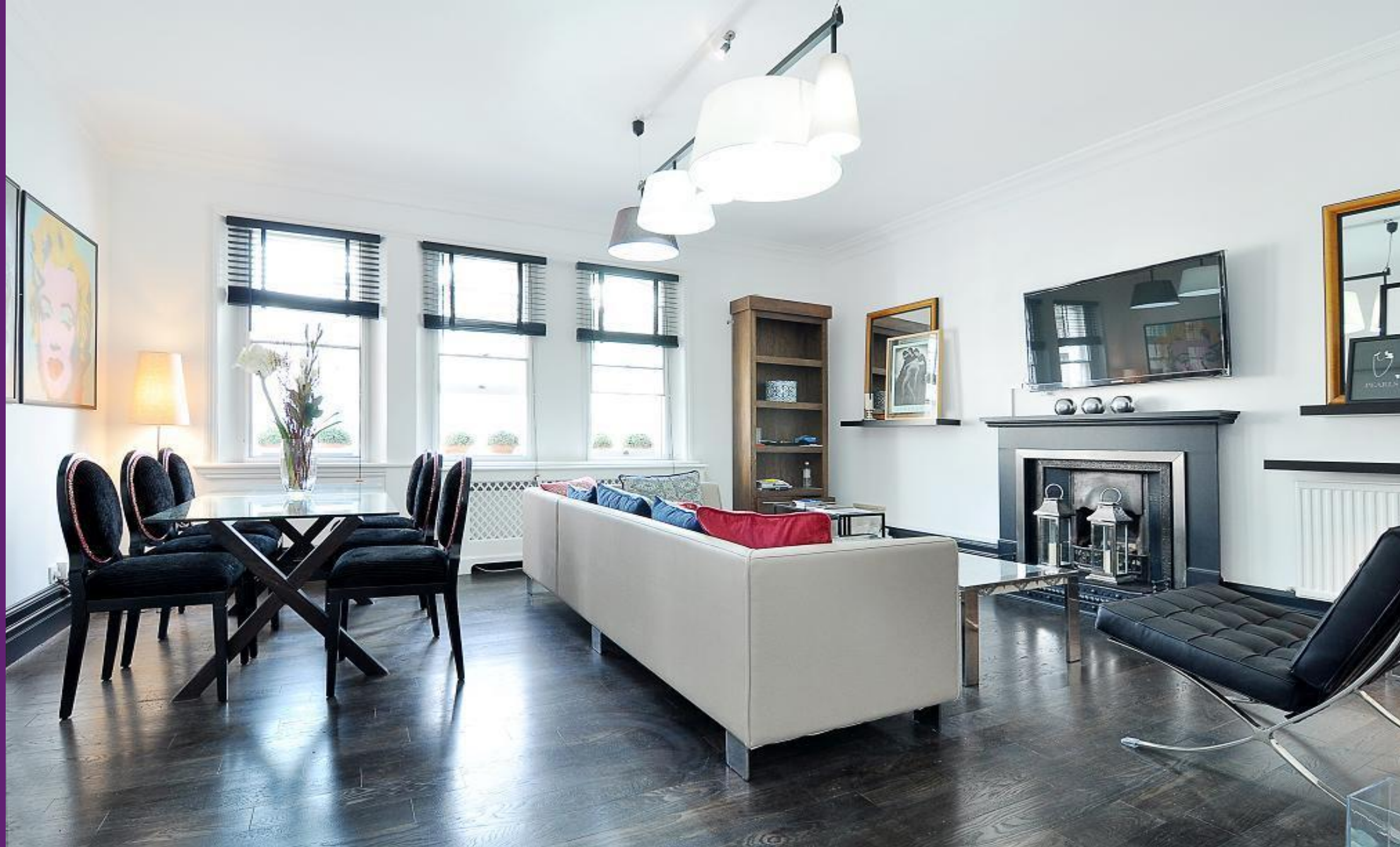
Sumner Place South Kensington, SW7