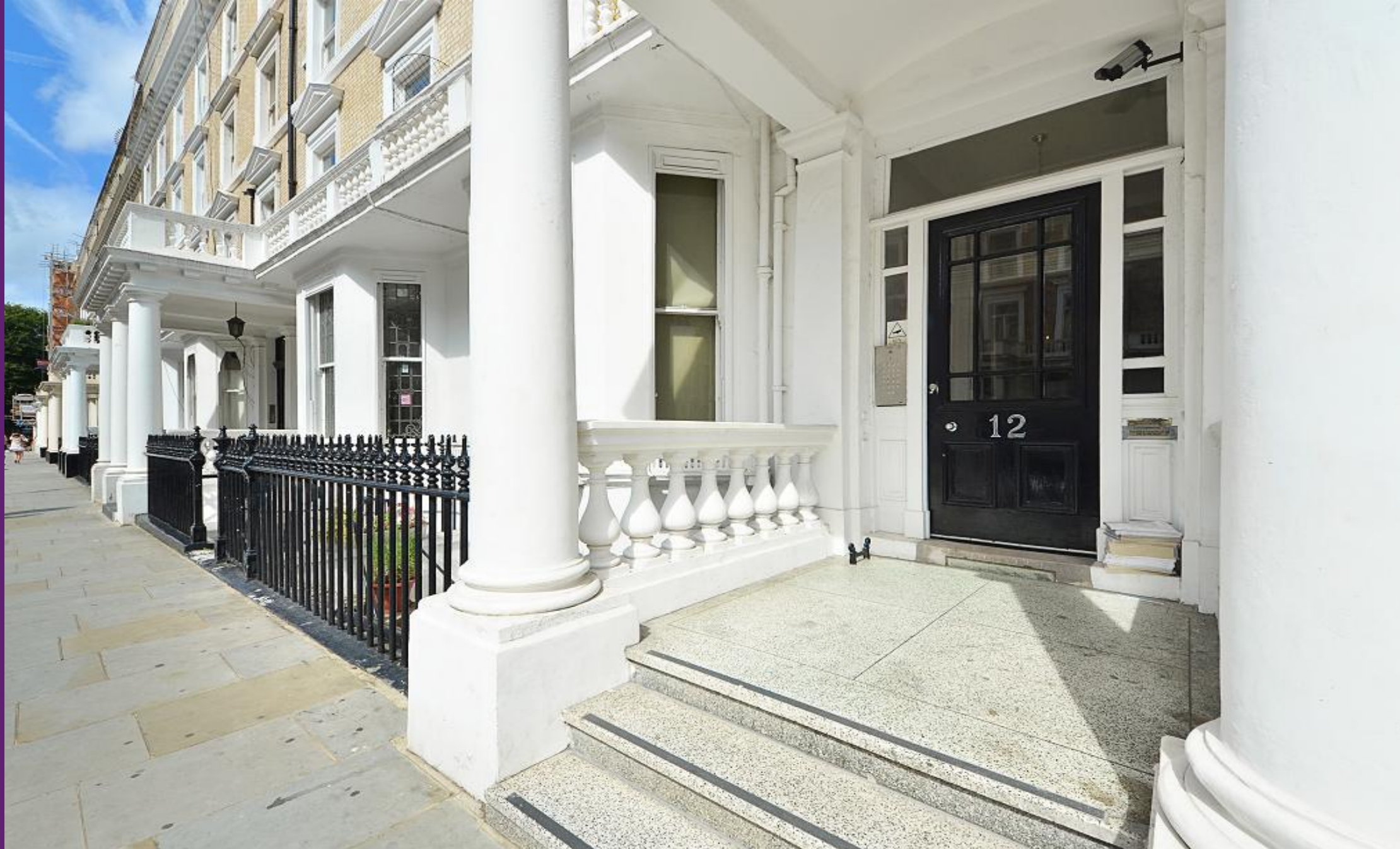
Elvaston Place South Kensington, SW7