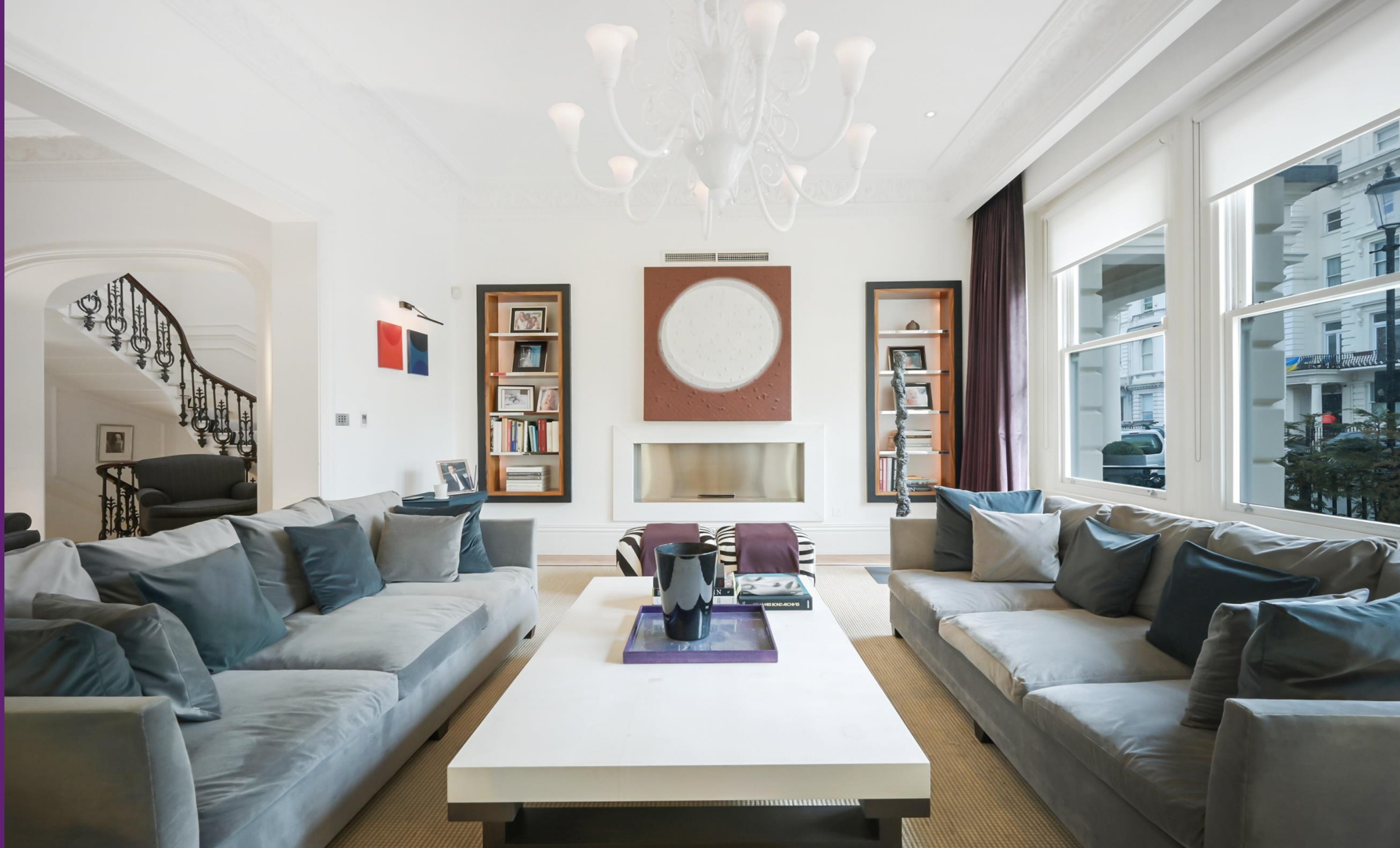
Queens Gate Terrace South Kensington, SW7