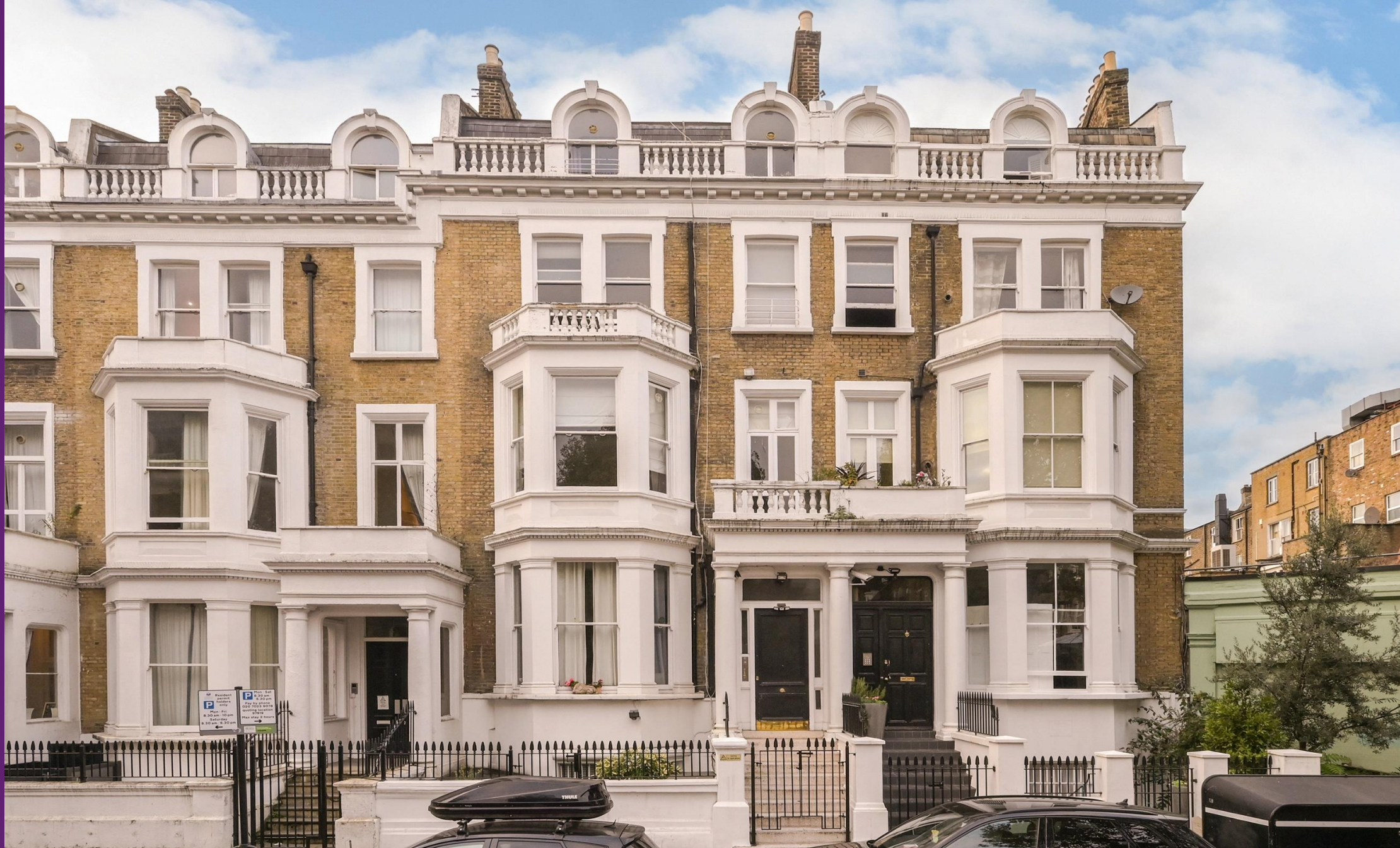
Penywern Road Earls Court, SW5