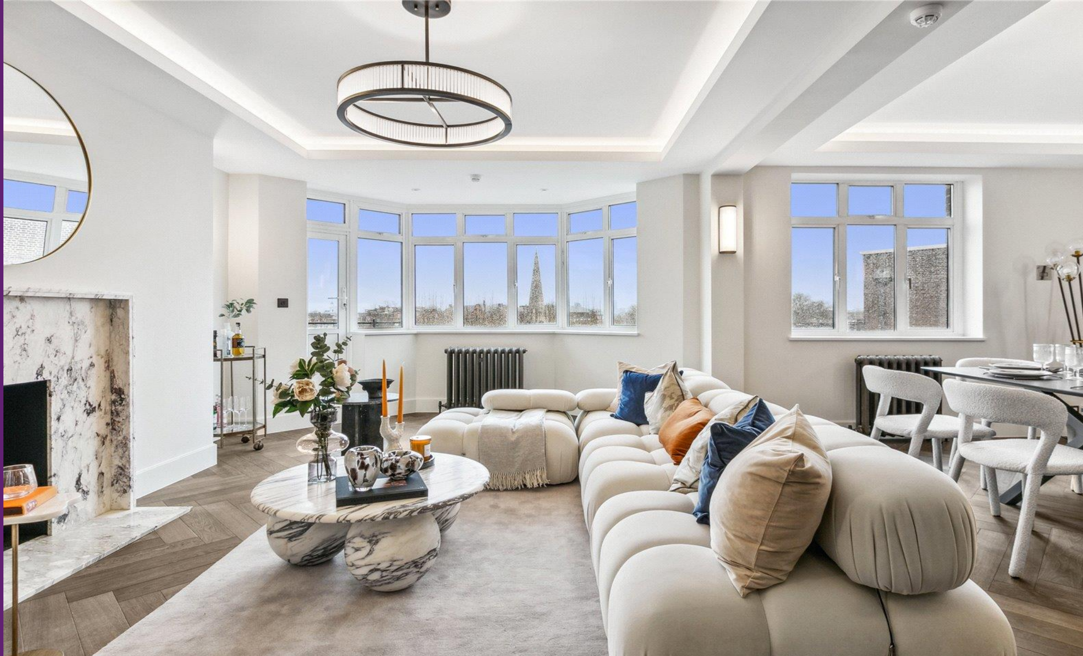
Onslow Crescent South Kensington, SW7