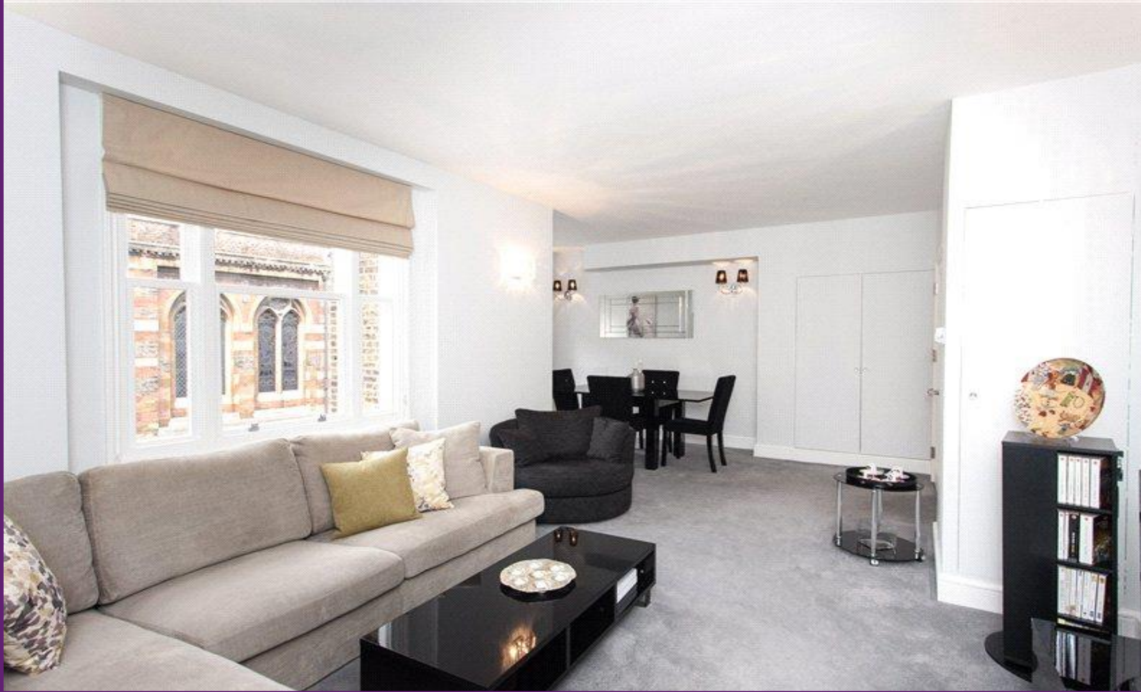
Manson Place South Kensington, SW7