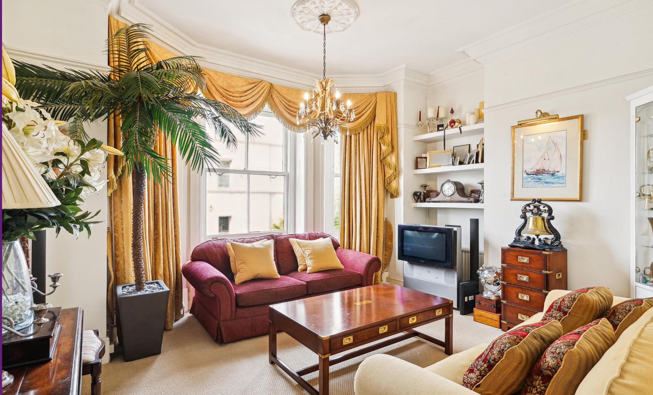
Earls Court Square Earls Court, SW5