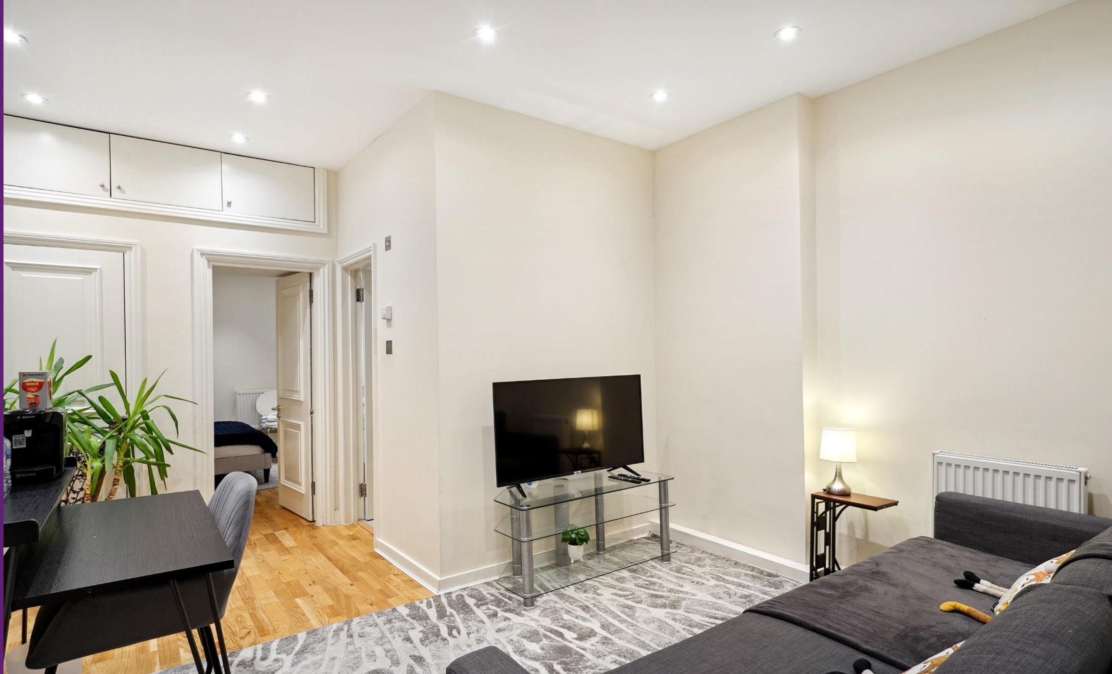
Cornwall Gardens South Kensington, SW7